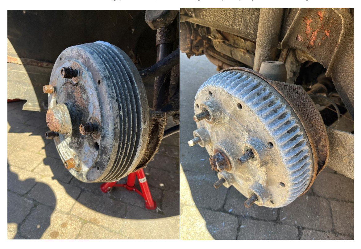
Above GT brakes (left), and ventilated backing plates in the rear brakes (right) Below all 4 rims are steel alloy Carrera rims dated 1960 and center piece riveted to outer rim as shown below

The car is equipped with unusual and rare GT options being Carrera Steel alloy rims, 60mm GT brakes front and ventilated backing plates rear, confirming the sport purpose and racing intention.